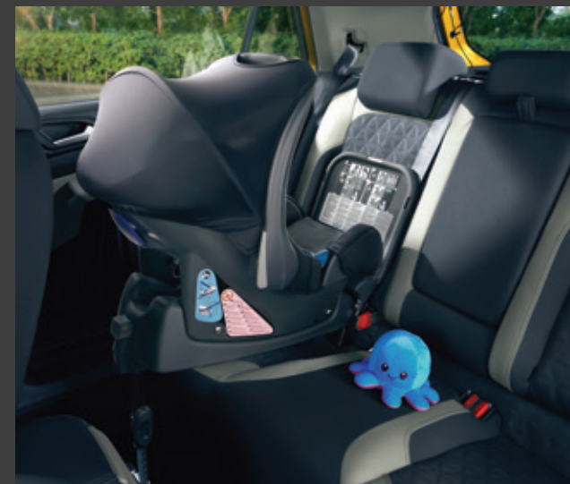
▲ ISOFIX Child Seat Mount