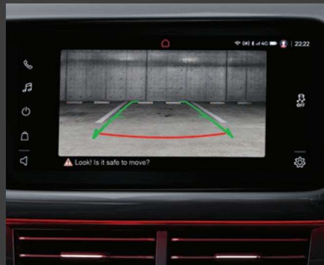
▲ Park Distance Control and Rear-view Camera