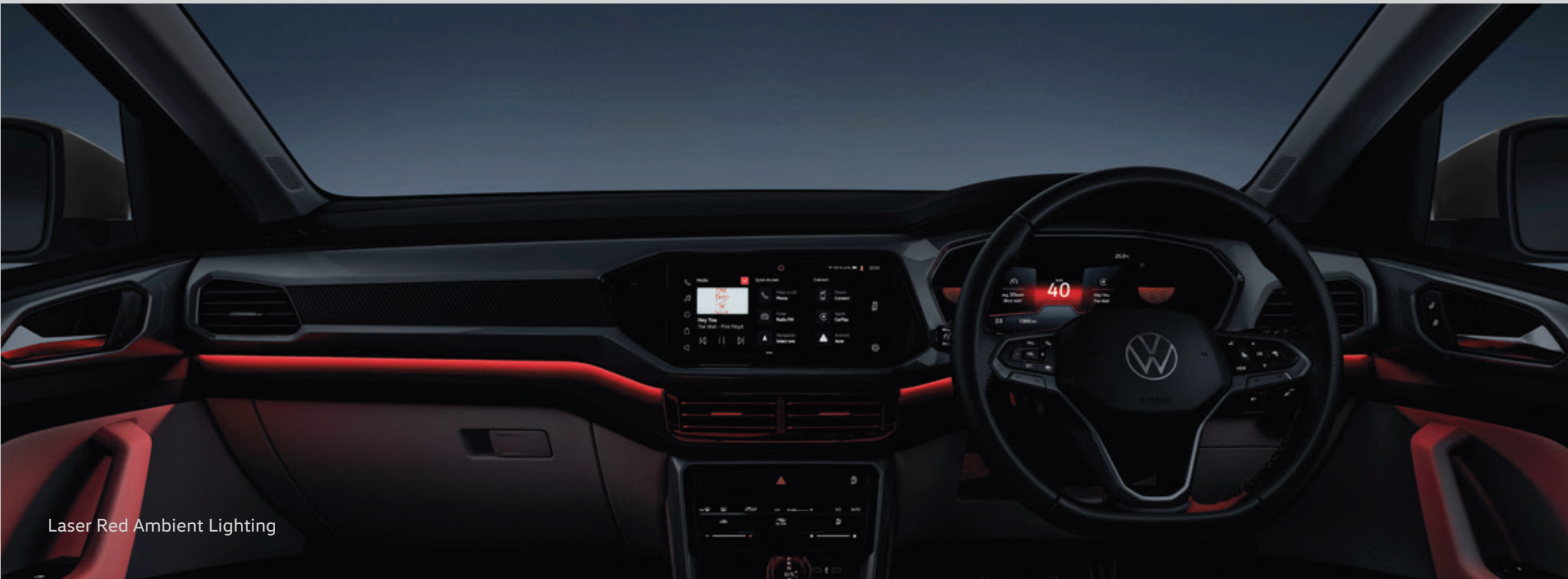
Laser Red Ambient Lighting